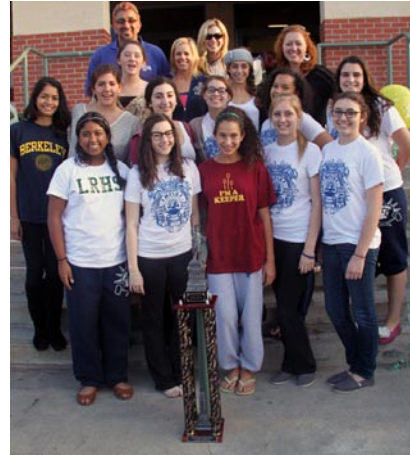
The World Champion Regent Mock Trial Team and their coaches pose with their first place trophy.